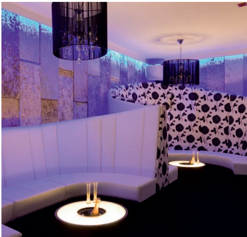
OPPOSITE PAGE: A kaleidoscope of colours on the dancefloor LEFT: boudoir glamour in the VIP area BELOW: decorative panels on the bar front glow with changing colours